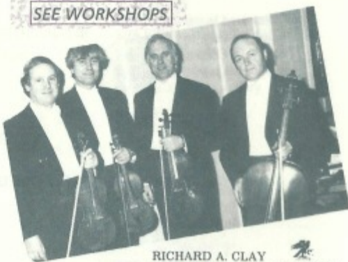
RICHARD A. CLAY & Co. LTD. representing ALLIED DUNBAR