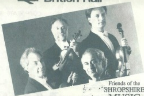
Friends of the SHROPSHIRE MUSIC TRUST