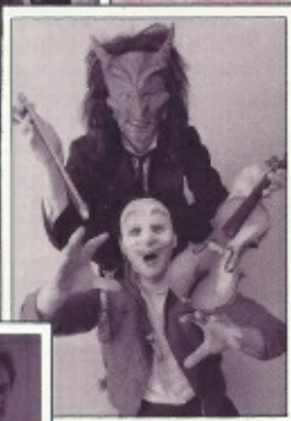
Birmingham Contemporary Music Group & Trestle Theatre Company