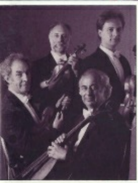
Allegri String Quartet