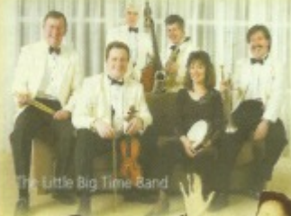
The Little Big Time Band