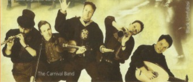
The Carnival Band