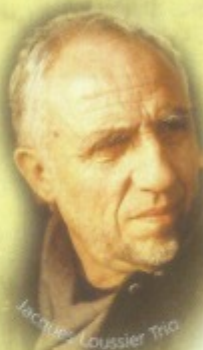
Jacques Loussier Trio