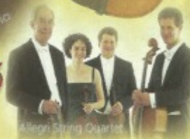
Allegri String Quartet